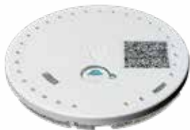
ROTOR FOR VETERINARY REAGENTS